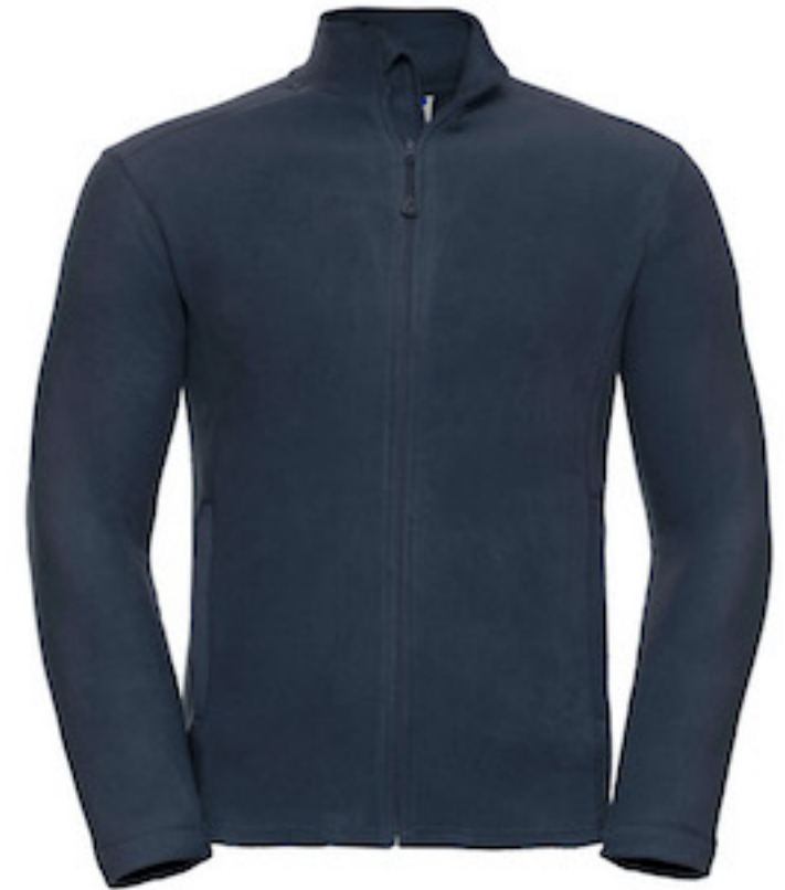
880M Men's Full Zip Microfleece SIZE XS-2XL