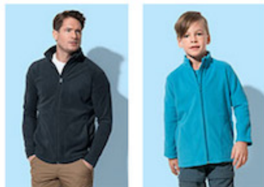
ST5030 Fleece Jacket ST5170 Fleece Jacket Kids